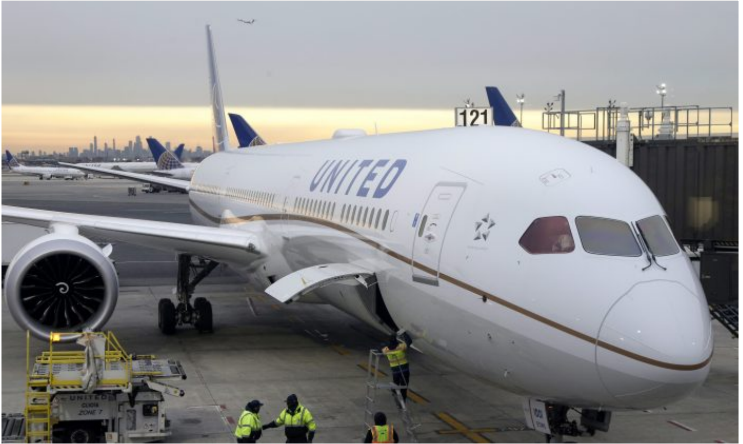
A Dreamliner 787-10 arriving from Los Angeles pulls up to a gate in Newark Liberty International Airport in Newark, N.J., on Jan. 7, 2019.