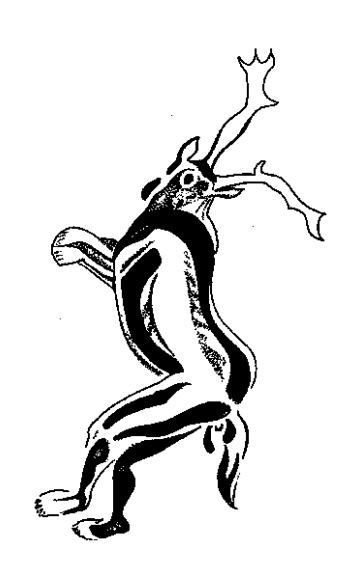
"The Sorcerer", a cave painting dating back approximately 20 thousand years

Images of a male consort or "husband" to the Goddess have been found dating back a similar age, complete with horns or antlers on his head as a sign that he represents not only human beings but also the entire natural and animal world. There is an example of this on a wall of Les Trois Freres cavern in France. This cave painting, thought to be about 20 thousand years old, has been nicknamed "The Sorcerer" and shows an upright human figure with a horse-like tail, a beard and large antlers on his head. When farming arrived, these ancient gods were expanded into this new domain and became deities of the crops and harvest, the rain and sun, the flocks and pastures, the fruits of the earth and the seasons.