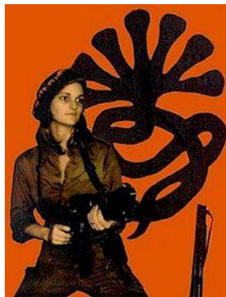
Symbionese Liberation Army (SLA) Patty Hearst Kidnapping FBI Files